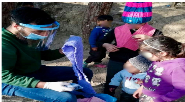
foto kamp Samos uitdelen mutsen en sjaals

Please let us know, so we can add your hometown to the map.